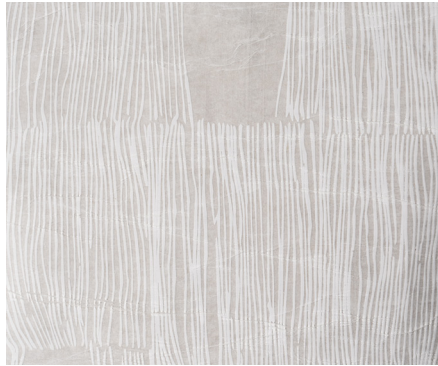
HARBOR GREY TYN-251